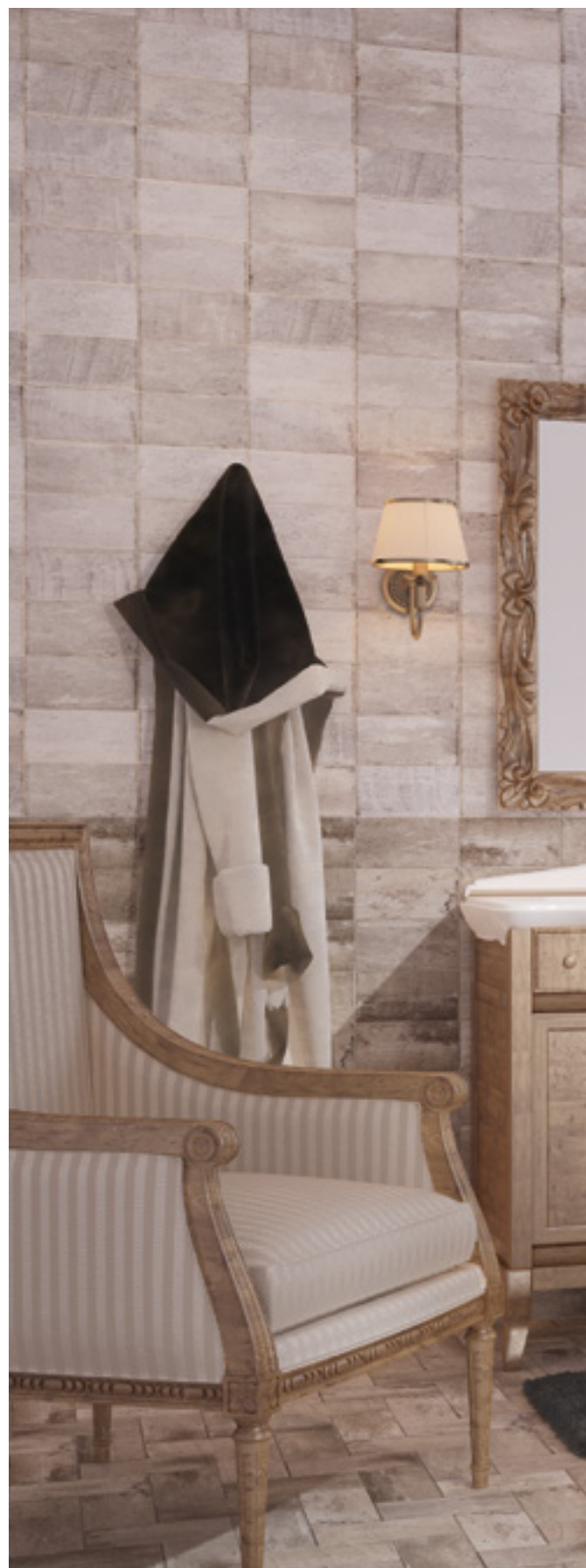
Wall Tiles: Village Blanco, Village Arena 10x20