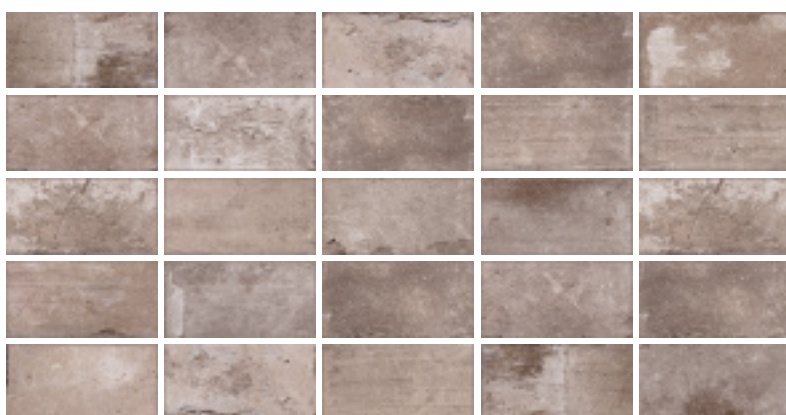
VILLAGE ARENA 25 DIFFERENT GRAPHICS