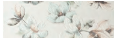
Dec. RIBALTA Blanco 4 20 x 60 P95 8,22 5.677.12.1472