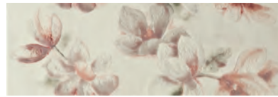
Dec. RIBALTA Arena 4 20 x 60 P95 8,22 5.677.17.1472