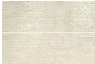
Dec. TORMES PACK-2 Arena 2 40 x 60 P125 4,01 5.757.17.2018