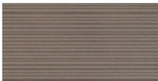
IKOM TENDENCE Noce 30,3 x 61,3 M27 11.722.160.1634 30 x 60 M32 35.422.160.1634 30 x 60 M40 39.422.160.1634