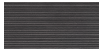
IKOM TENDENCE Negro 30,3 x 61,3 M27 11.722.3.1634 30 x 60 M32 35.422.3.1634 30 x 60 M40 39.422.3.1634

Piezas complementarias ver en pag 349 Special pieces see page 349 Pièces supplémentaires, voir page 349