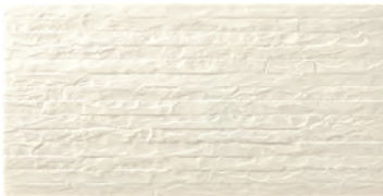
Metz Relieve Blanco 30,3x61,3 M21 11.722.12.2774