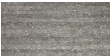
Metz Relieve Grafito 30,3x61,3 M21 11.722.68.2774