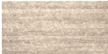
Metz Relieve Hueso 30,3x61,3 M21 11.722.16.2774