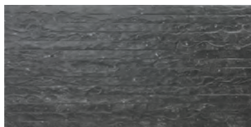
Metz Relieve Negro 30,3x61,3 M21 11.722.3.2774