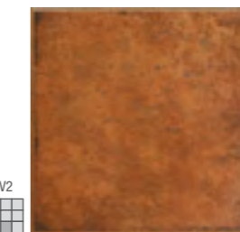
1367 MONTI-R B-4 (33x33) (3-0-H) *** 4370 MONTI-R/A B-6 (33x33) (4-1-H) *** R-10