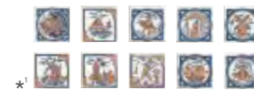
*0865 T. ARTESA P-1 (7x7)