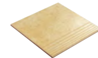
*4384 P. MONTI-H/A P-23 (33x33)