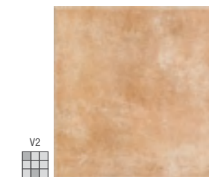
1368 MONTI-C B-4 (33x33) (3-0-H) *** 4369 MONTI-C/A B-6 (33x33) (4-1-H) *** R-10