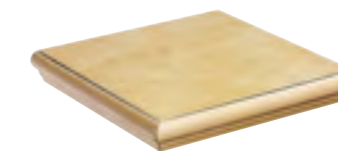
*4467 A.T. MONTI-H/A P-55 (33x33)