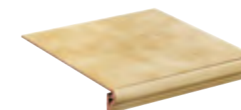
*4464 T. MONTI-H/A P-44 (33x33)