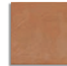
COTTO TIJOLO 30x30 NAT 30x30RECT [29,6x29,6cm] P77 P90