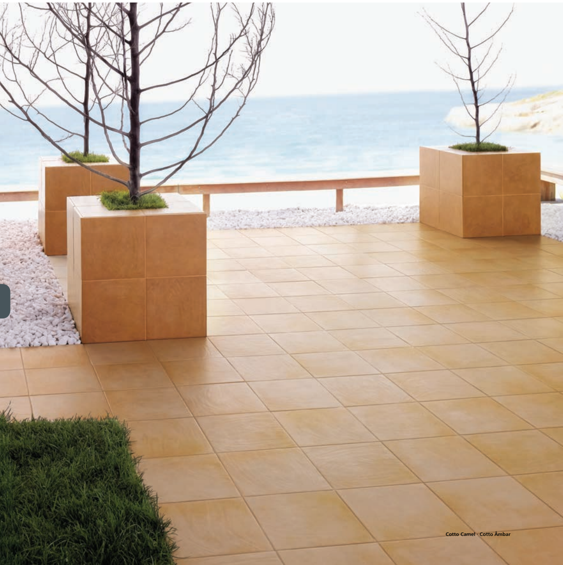
Cotto Camel · Cotto Âmbar