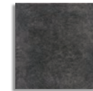
LUNAR PRETO 30x30 RECT [29,6x29,6cm] P91