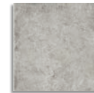
ARDÓSIA CINZA 30x30 NAT 30x30RECT [29,6x29,6cm] P65 P78