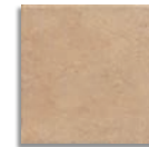
ARDÓSIA BEGE 30x30 NAT 30x30RECT [29,6x29,6cm] P65 P78