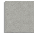
PEDRA CINZA 30x30 NAT 30x30RECT [29,6x29,6cm] P66 P79