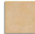
COTTO CAMEL 30x30 NAT 30x30RECT [29,6x29,6cm] P70 P83