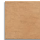
(4) TIJOLEIRA ÂMBAR 30x30 NAT 30x30RECT [29,6x29,6cm] P69 R11 P82