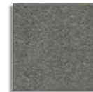
PEDRA PRETO 30x30 NAT 30x30RECT [29,6x29,6cm] P67 P80