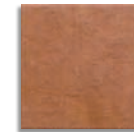
(4) TIJOLEIRA TERRACOTA 30x30 NAT 30x30RECT [29,6x29,6cm] P69 R11 P82