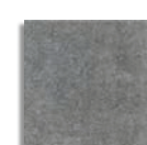
LUNAR GRAFITE 30x30 RECT [29,6x29,6cm] P91