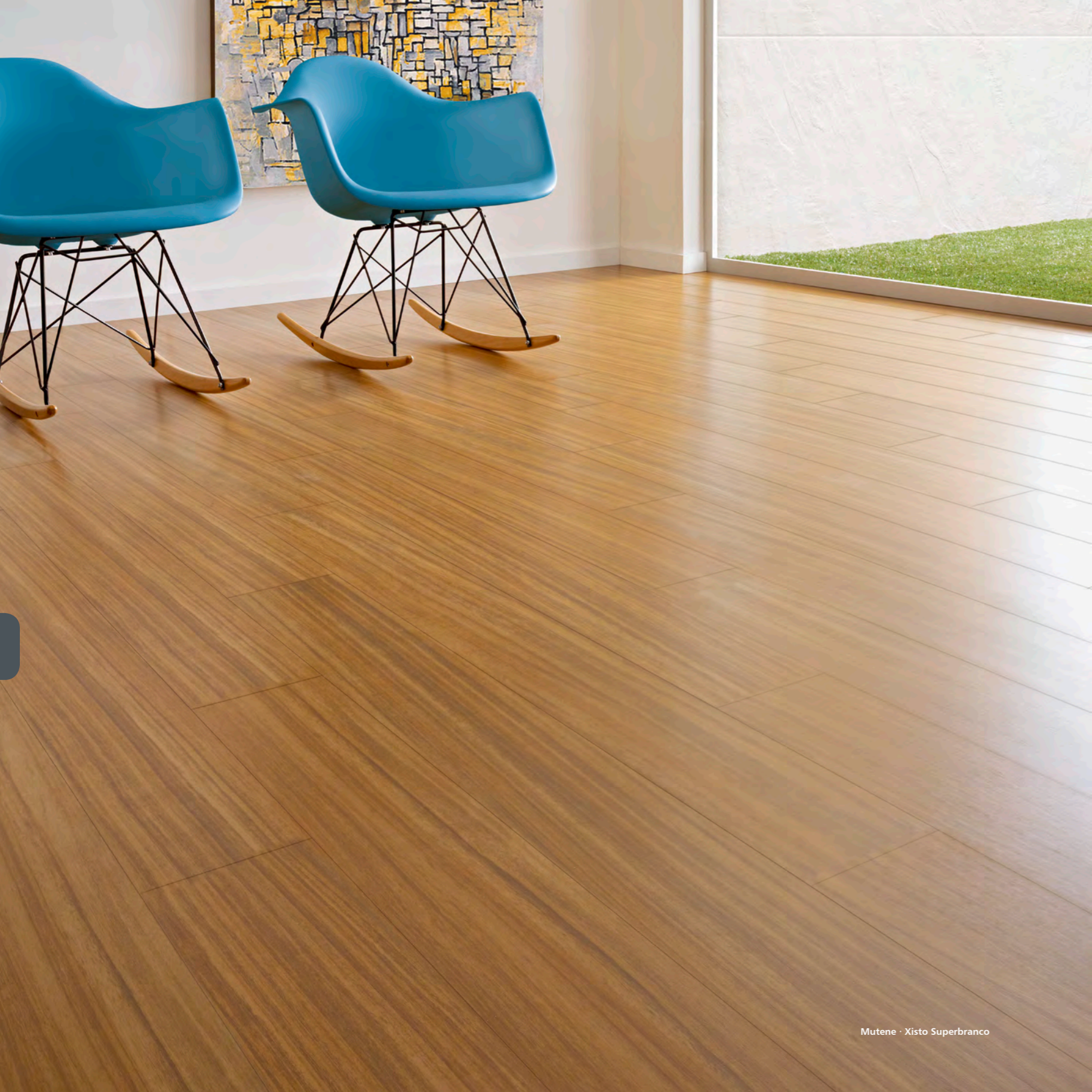
Mutene · Xisto Superbranco