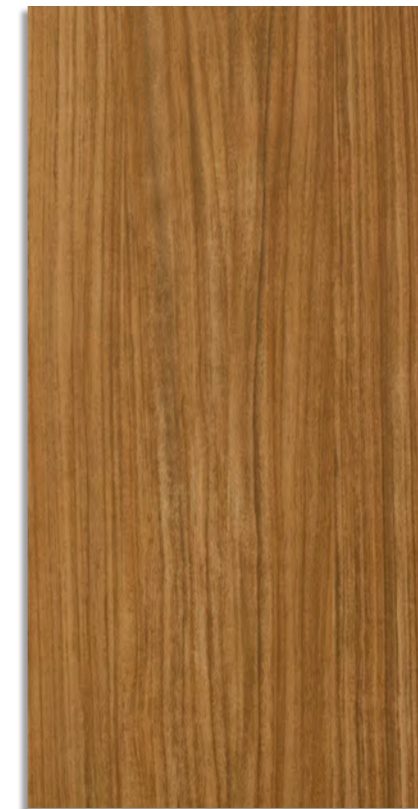
(6) MUTENE 60x120 RECT [ 59,2x118,4 cm] P146